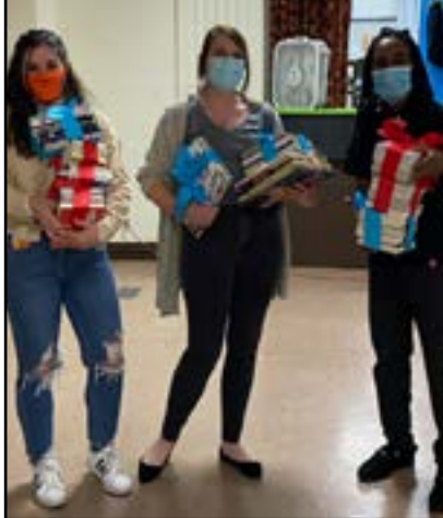
Book Drive - UofI School of Social Work Professional Practice Seminar & UniPlace Church

Make a donation ONLINE or mail it to P.O. Box 11, Champaign, IL 61824.